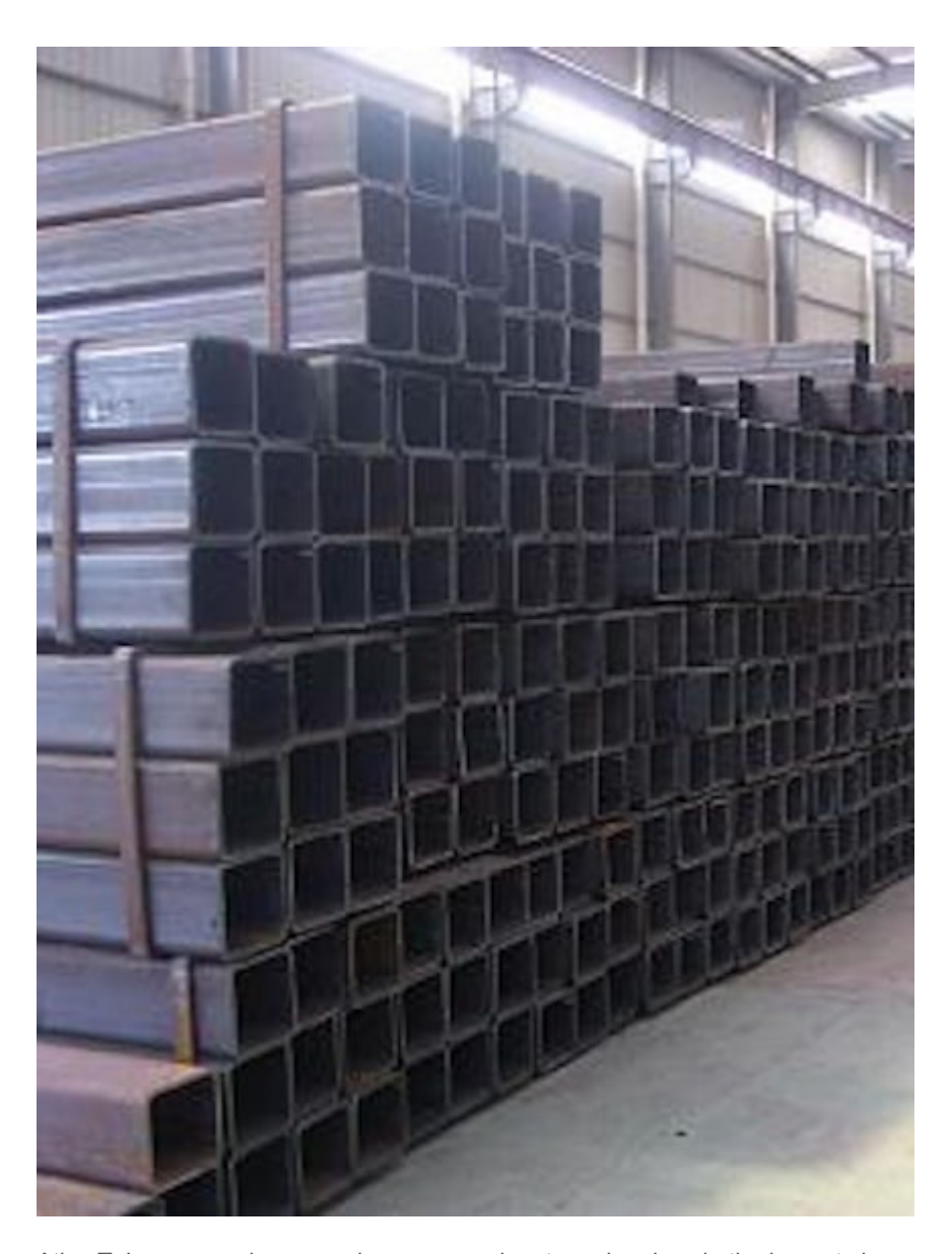
Atlas Tube can produce round, square, and rectangular sizes in the largest size range in North America.

ATLAS TUBE, A DIVISION OF ZEKELMAN INDUSTRIES PLYMOUTH, MI – AVERAGE STEEL SUPPLY MIX